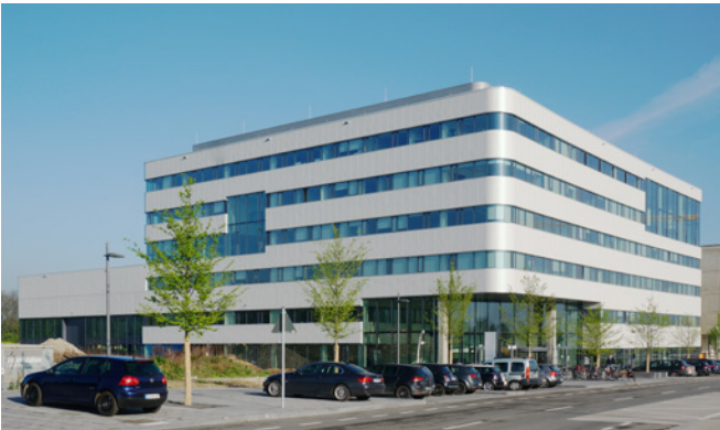
Logistics Cluster – 1st phase of construction