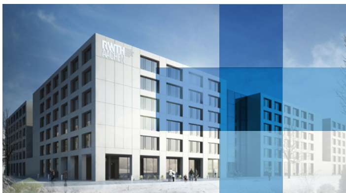
Production Engineering Cluster – 1st phase of construction

This close cooperation will facilitate coordination processes, increase the speed and quality of research results and help cut research and development costs. Industrial partners can use the research infrastructure and competence of RWTH Aachen University at various levels of intensity – from basic research, the further development of individual technologies, right through to the development of a marketable product.