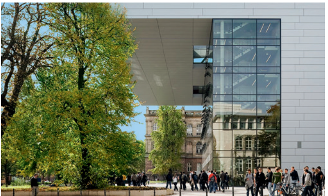
Campus Mitte (Campus Central)

The RWTH Aachen Campus is an important element for the university to help consolidate its leading national position, establish itself internationally and remain successful in the competition amongst universities.