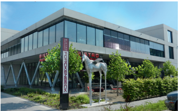
First restaurant concept on the Campus Melaten

Apart from companies, research institutions and university institutes, shops, hotels, restaurants and service facilities are also moving to the campus. In winter 2014, the first bilingual day-care facility for children was completed in the park on the Campus Boulevard. The bistro restaurant Forckenbeck opened on the Campus Melaten in 2012.