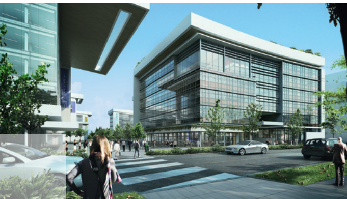
Photonics Cluster – 1st phase of construction

The following teams of architects and investors have been selected up to now: for the Logistics Cluster, ante4C GmbH (Aachen) with the architect's office Meyer & van Schooten (Amsterdam), for the Production Engineering Cluster, IMMOFINANZ Group (Vienna) with Henn architects (Munich) and for the Photonics Cluster, ante4C GmbH (Aachen) with KPF architects (New York).